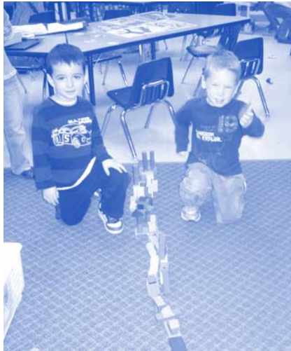
Working together is fun!

individual portfolios. Though very time consuming, they now each have a very impressive collection of their accomplishments, as well as a basis for self-evaluation and director evaluation. As school staff, we know what our purpose is, we know our strengths, we have identified areas we want to improve, and