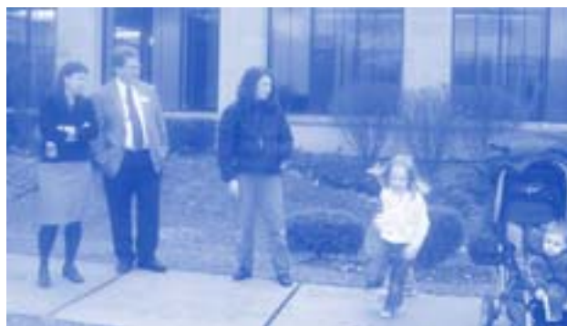
Observing Daily Happenings at Grace