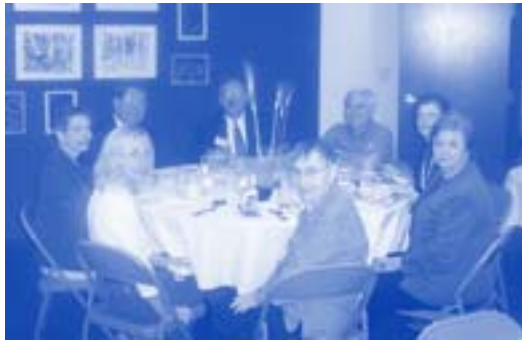
ELEA Accreditation Team Members

Admittedly, the accreditation process demands a commitment of time, energy, and money. The rewards far outweigh the investment. More than just the beautiful plaque that greets everyone in the office, the school has received