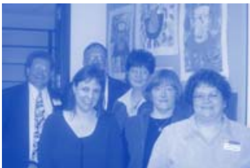
Accreditation Team On Site at Grace

The school houses 237 students from preschool through eighth grade and is mainly supported through parental contributions and fees, with significant support from the congregation. It